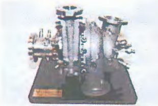
Upper Stage Engine Technology (USET)

The Upper Stage Engine Technology effort validated advanced physics-based modeling, simulation, and analysis tools for liquid rocket engines using a high performance turbo-pump. These tools are being used by both industry and government to better understand existing engine designs and develop new engine designs for space launch systems.