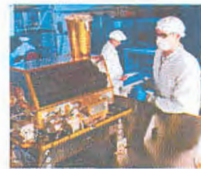
Commercially Hosted IR Payload (CHIRP) Sensor

The 3rd Generation Infra-Red System Risk Reduction CHIRP sensor, developed for AF SMC and AFRL, offers a wide-field-of-view overhead persistent infrared sensor for early warning of missile launches and to support other military missions. Upgraded from a ground prototype and delivered in less than two years, CHIRP was integrated onto a commercial telecommunications satellite and launched in September 2011.