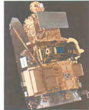
Near Field Infrared Experiment (NFIRE)

NFIRE, a passive, multi-spectral satellite, was launched in 2007 to track missiles in flight. Its suite of high-performance sensors has collected near-field, high-, and low-resolution images of a boosting rocket. In addition to missile tracking functions, NFIRE operators also execute risk reduction data collections to support future MDA programs for low-earth orbit tracking systems and sea-based Standard Missile programs. In 2011, a German built Laser Communications Terminal payload aboard NFIRE achieved simultaneous atmospheric data collection during a bi-directional (full duplex) laser communications link with the German TerraSAR-X satellite. The satellites communicated approximately 5.6GB data every 7.3 seconds or roughly one DVD worth of data every 3.7 seconds across a separation distance of approximately 10,000 km.