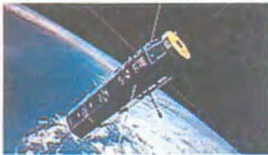
Communications/Navigation Outage Forecasting System (C/NOFS)

electron content; and a data center that assimilates the data from the satellite and ground sensors into models of the ionosphere, forecasts the state of the ionosphere, and assesses which regions of the ionosphere are likely to cause scintillation problems. In addition to serving as the pathfinder for space situational awareness environmental monitoring and providing key data for the SBEM AoA, the C/NOFS program is the centerpiece of on-going efforts to develop, validate and transition state-of-the-art forecasting models of the space