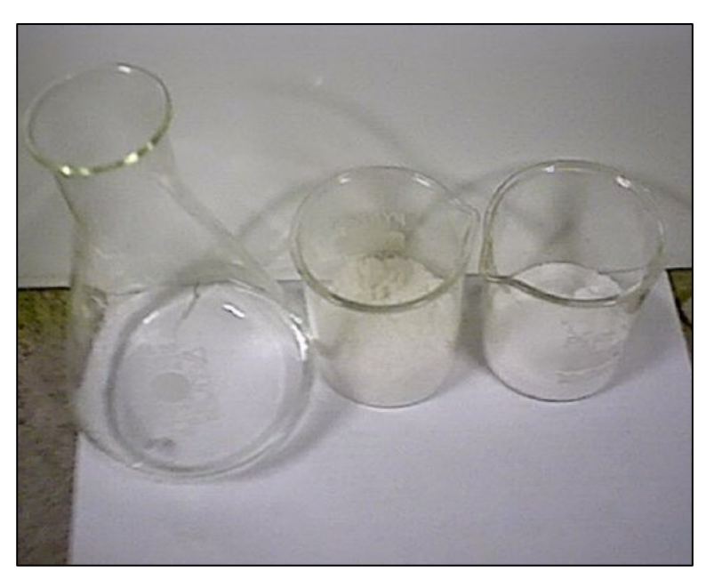
Hydrogen peroxide, hexamine, and citric acid

IMPORTANT: The following indicators of acquisition and manufacturing may be innocuous or constitutionally protected activities. Instances without a reasonable explanation should be evaluated while considering the totality of the circumstances, additional indicators, or observed behaviors reasonably indicative of terrorism before being reported as suspicious activity.