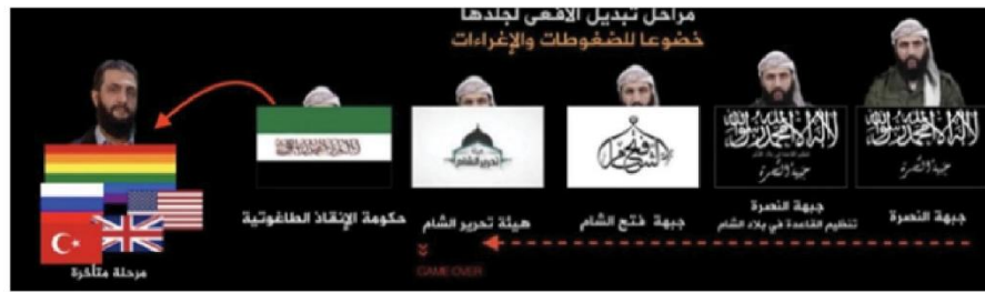
Pro-ISIS meme making fun of Hay'at Tahrir al-Sham leader Abu Muhammad al-Jawlani's turn toward the West