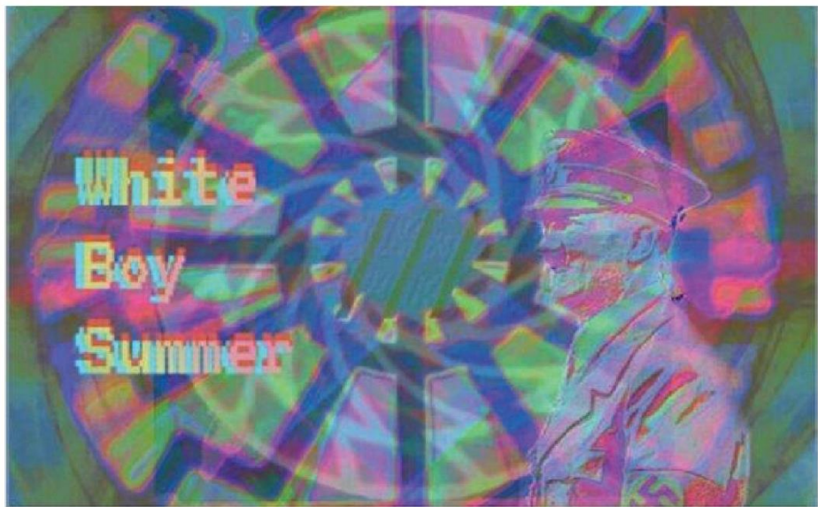
Hitler approved WBS.

Some racially or ethnically motivated violent extremists (RMVE) use WBS memes to promote racism and misogynistic rhetoric and to incite violence. Some RMVEs have adopted WBS as a slogan and use it for their own purposes. WBS is referenced in the 136-page Militant Accelerationism: A Collective Handbook , published in June 2021, which is popular with RMVEs.