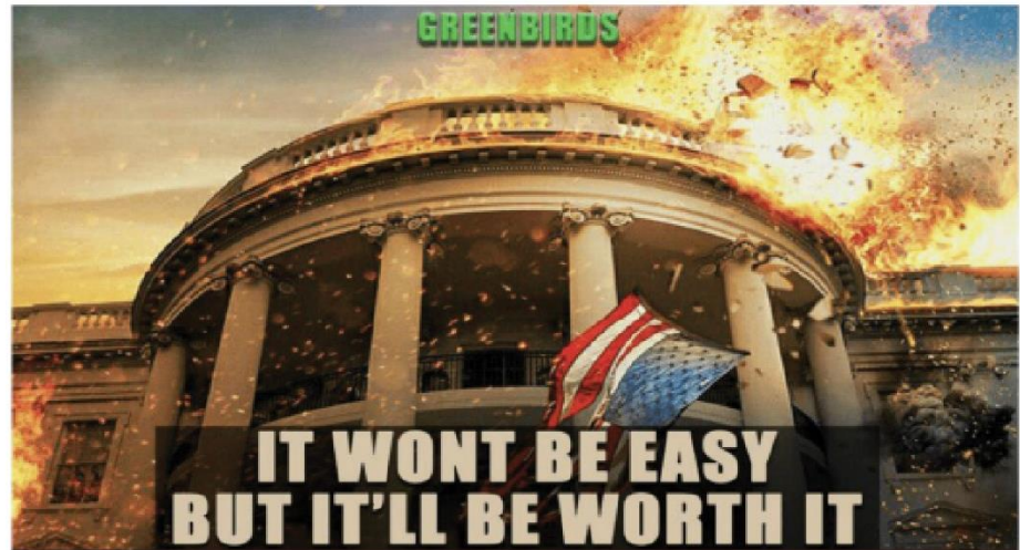
Pro-ISIS supporters promoting violence against the White House