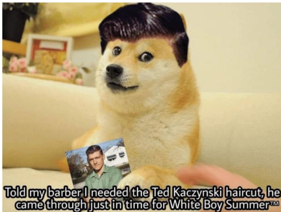
WBS meme referencing “Unabomber” Ted Kaczynski USPER (a popular figure among RMVEs)

Anti-Semitic uses of WBS, such as this one, include references to Nazi war atrocities as the “original WBS” and suggest that Adolf Hitler was the embodiment of WBS.