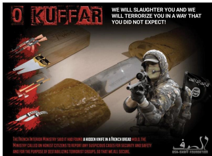
Pro-ISIS supporters urging would-be attackers to use simple or easily accessible weapons to conduct attacks