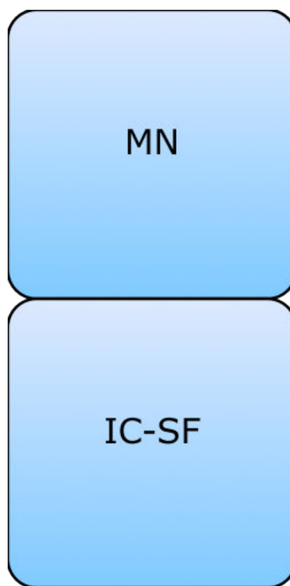
Figure 1 : Related Specifications