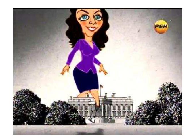
Simonyan steps over the White House in the introduction from her short-lived domestic show on REN TV (REN TV, 26 December 2011)

Wall Street greed, and the US national debt. Some of RT's hosts have compared the United States to Imperial Rome and have predicted that government corruption and "corporate greed" will lead to US financial collapse (RT, 31 October, 4 November).