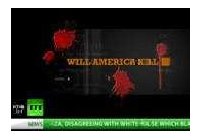
RT new show "Truthseeker" (RT, 11 November)

RT aired a documentary about the Occupy Wall Street movement on 1, 2, and 4 November. RT framed the movement as a fight against "the ruling class" and described the current US political system as corrupt and dominated by corporations. RT advertising for the documentary featured Occupy movement calls to "take back" the government. The documentary claimed that the US system cannot be changed democratically, but only through "revolution." After the 6 November US presidential election, RT aired a documentary called "Cultures of Protest," about active and often violent political resistance (RT, 1-10 November).