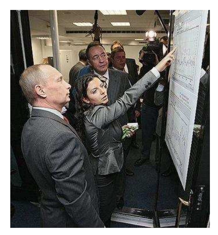
Simonyan shows RT facilities to then Prime Minister Putin. Simonyan was on Putin's 2012 presidential election campaign staff in Moscow (Rospress, 22 September 2010, Ria Novosti, 25 October 2012).

The Kremlin staffs RT and closely supervises RT's coverage, recruiting people who can convey Russian strategic messaging because of their ideological beliefs.