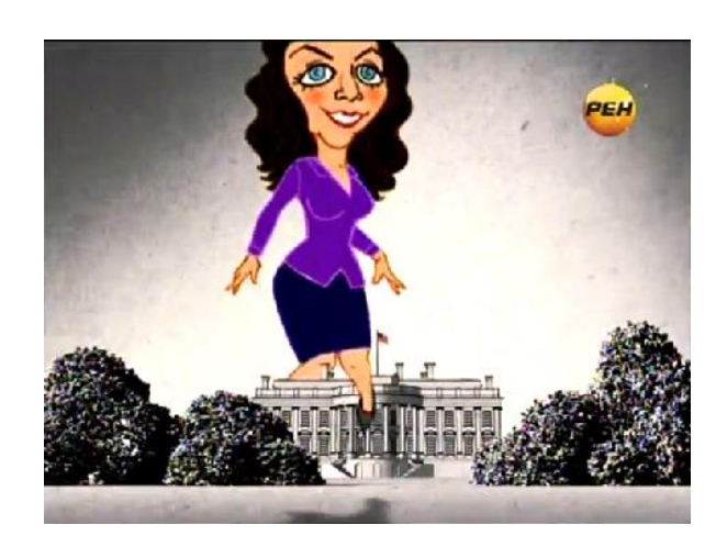
Simonyan steps over the White House in the introduction from her short-lived domestic show on REN TV (REN TV, 26 December 2011)

RT has also focused on criticism of the US