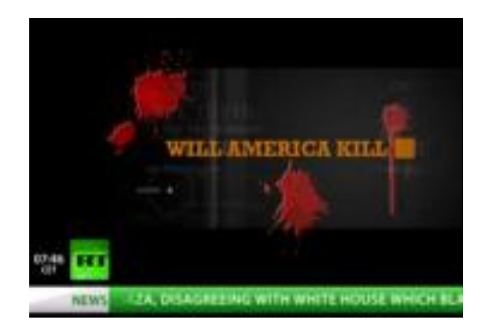
RT new show "Truthseeker" (RT, 11 November)

RT aired a documentary about the Occupy Wall Street movement on 1, 2, and 4 November. RT framed the movement as a fight against "the ruling class" and described the current US political system as corrupt and dominated by corporations. RT advertising for the documentary featured Occupy movement calls to "take back" the government. The documentary claimed that the US system cannot be changed democratically, but only through "revolution." After the 6 November US presidential election, RT aired a documentary called "Cultures of Protest," about active and often violent political resistance (RT, 1-10 November).