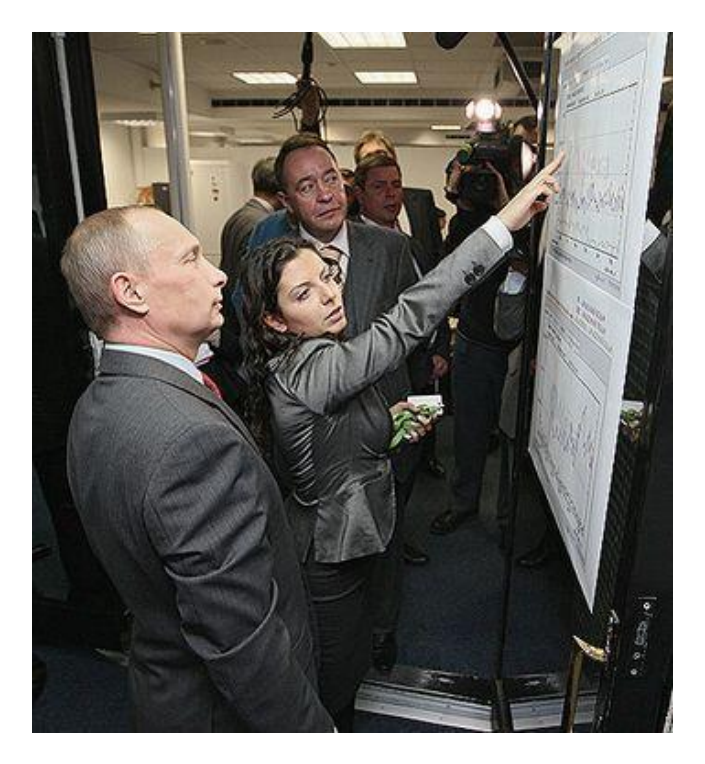
Simonyan shows RT facilities to then Prime Minister Putin. Simonyan was on Putin's 2012 presidential election campaign staff in Moscow (Rospress, 22 September 2010, Ria Novosti, 25 October 2012).

The Kremlin staffs RT and closely supervises RT's coverage, recruiting people who can