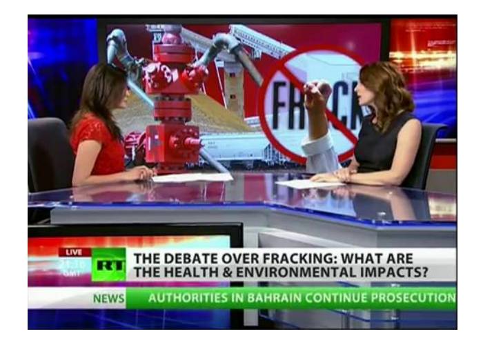
RT anti-fracking reporting (RT, 5 October)

In an earlier example of RT's messaging in support of the Russian Government, during the Georgia-Russia military conflict the channel accused Georgians of killing civilians and organizing a genocide of the Ossetian people. According to Simonyan, when "the Ministry of Defense was at war with Georgia," RT was "waging an information war against the entire Western world" ( Kommersant , 11 July).