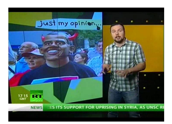
Messaging on RT prior to the US presidential election (RT, 3 November)

party candidate debates and ran reporting supportive of the political agenda of these candidates. The RT hosts asserted that the US two-party system does not represent the views of at least one-third of the population and is a "sham."